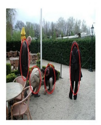
Figure3: Kernel Based Tracking