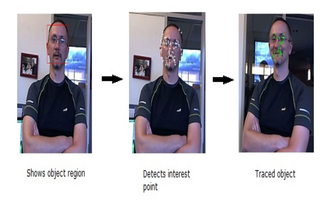
Figure 2: Point Based Tracking

The relationship of the points is based on the preceding object region which contains object position and motion. This approach involves an exterior mechanism to detect the objects in every frame.